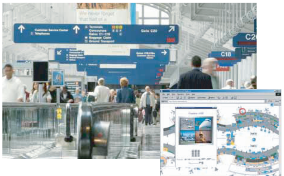
Example of custom user interface

The large scale digital video solution to help protect facilities, assets, passengers, pilots and airport staff